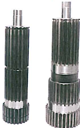
9820 Splitter Shaft 9823 Splitter Shaft